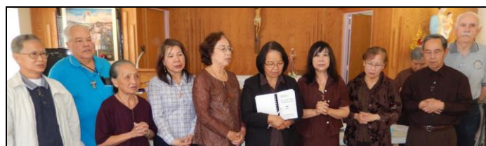
New St. Anthony of Padua Fraternity Council 2014-2017

Because of good preparation and for the work of all the fraternity members, the elections went very smoothly. Thanks to the entire fraternity for their efforts! Congratulations for the new council for the term of 2014-2017.