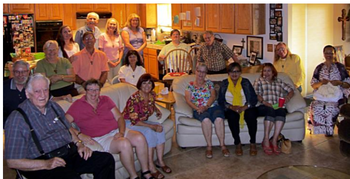
Members of district fraternities at recent movie gathering!

St. Francis and St. Clare Fraternity (Hemet) hosted a movie night for the District on June 29 th with a pot luck dinner during intermission. The movie told the story of Sts. Peter and Paul after the death of Christ. The District had a meeting of the Ministers, Vice Ministers and Formation Directors on July 26, 2014 hosted by Padre Pio Fraternity. Discussions covered how to improve fraternity life and attract new members.