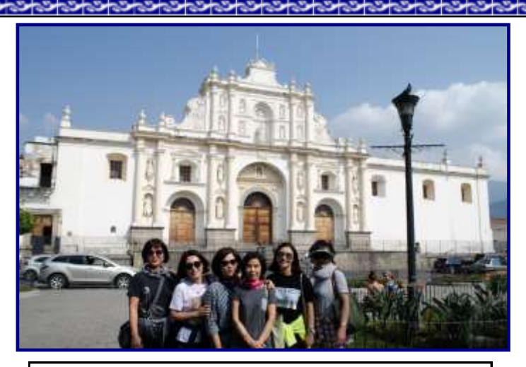
Franciscan Sisters from San Diego Fraternity In Antigua, Guatemala