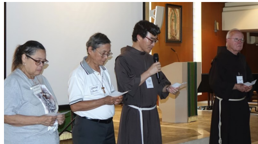
Multi-lingual Closing Prayer