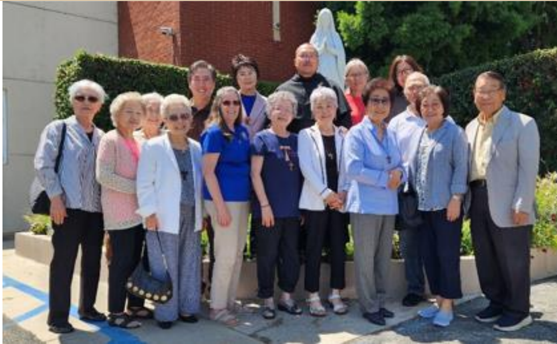
St. Maximilian Mary Kolbe Fraternity had a fraternal visit on August 25th.