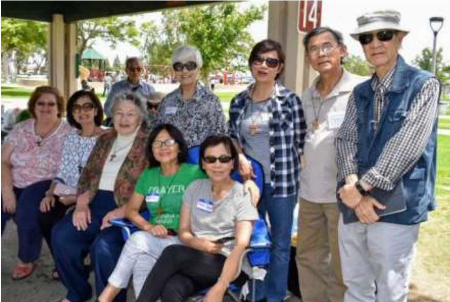
Meeting Friends, Old and New