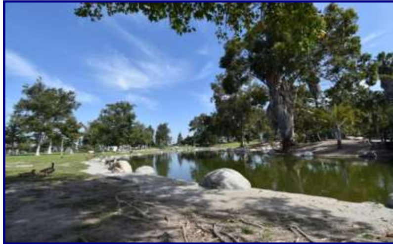
Mile Square Regional Park, Fountain Valley, CA

It was a pleasant early summer day for all of us to spend some leisure time at the park. Despite schedule conflict experienced by our brothers and sisters of the Korean speaking fraternities, there were still many of us attended the picnic.