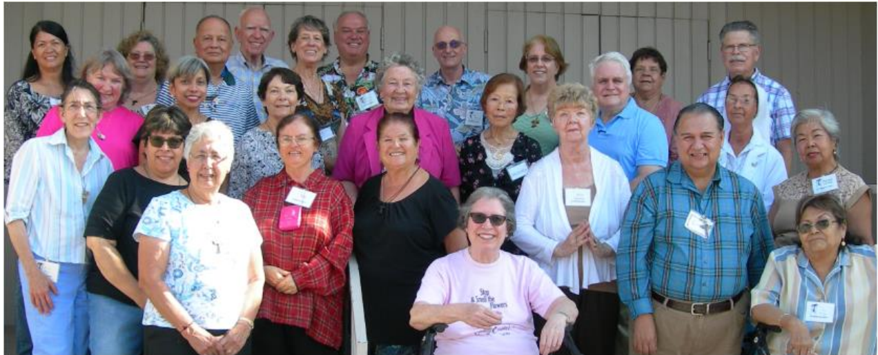
August Fraternity meeting

Fraternity Council Meeting: Sunday, Sept 23 - 2 pm at Tina's