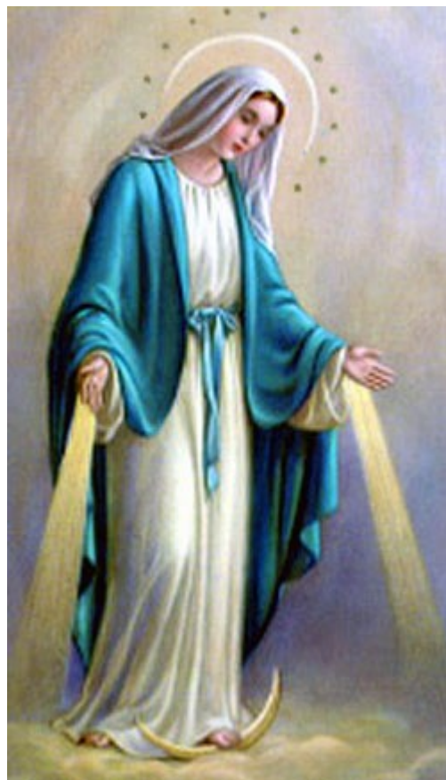
Mary Queen of Peace Pray for us

November All Saints, All Souls', St Martin de Porres, St Leo the Great, St Josaphat, St Frances Xavier Cabrini, St Albert the Great, St Margaret of Scotland, St Gertrude, St Elizabeth of Hungary, Presentation of the Blessed Virgin Mary, St Cecilia, St Clement I, St Columbian, Bl Miguel Agustin Pro, St Andrew Dung-Lac & Companions, & St Andrew pray for us.