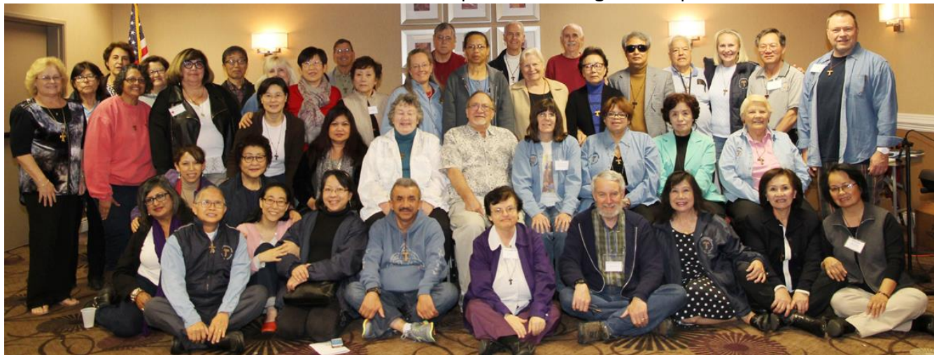
St. Francis Chapter of Elections, January 17 th , 2015 Best Western Plus Inns, Ontario, CA.

Secular Franciscan Order | St. Francis Region #52 | Southern California