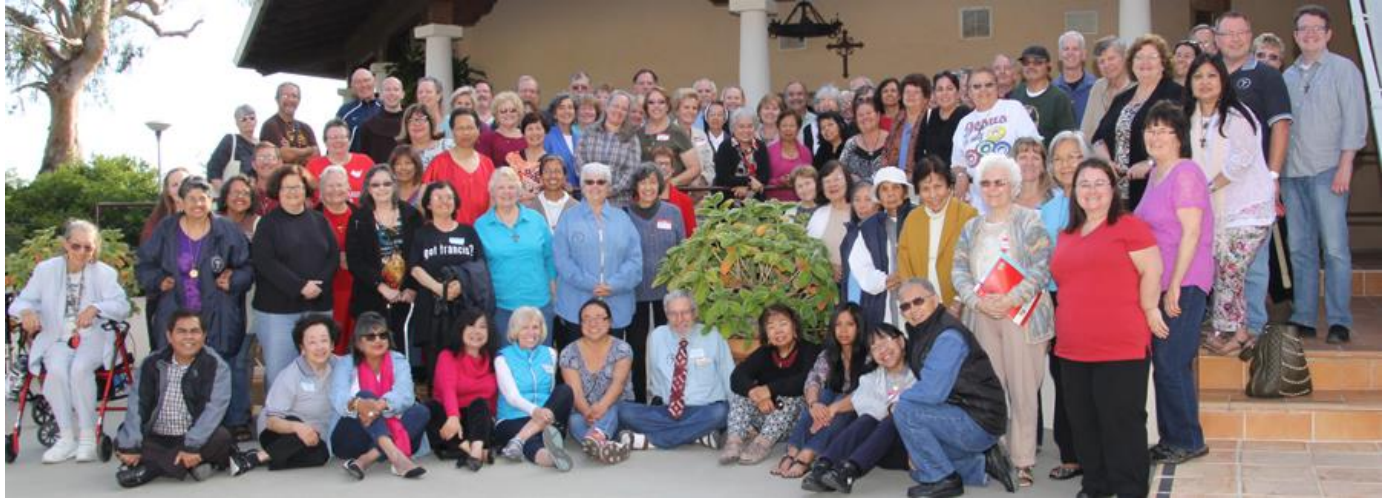
St. Francis 2015 Annual Retreat at Serra

Secular Franciscan Order | St. Francis Region #52 | Southern California