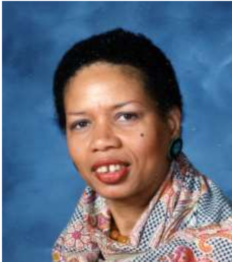
JUDITH MUSSATTO MINISTER