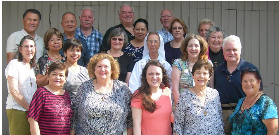
July's Fraternity meeting