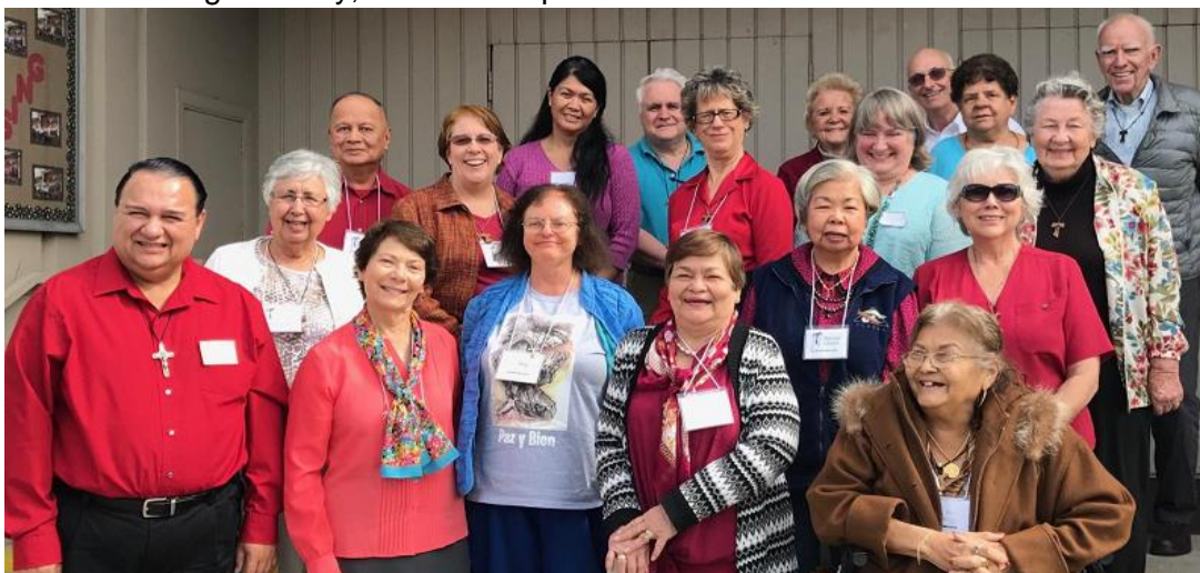
May Fraternity meeting, welcome guests!