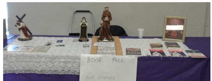
Carol donated a tableful of books to share - thank you!

This is our big fundraiser! All proceeds go to the poor!